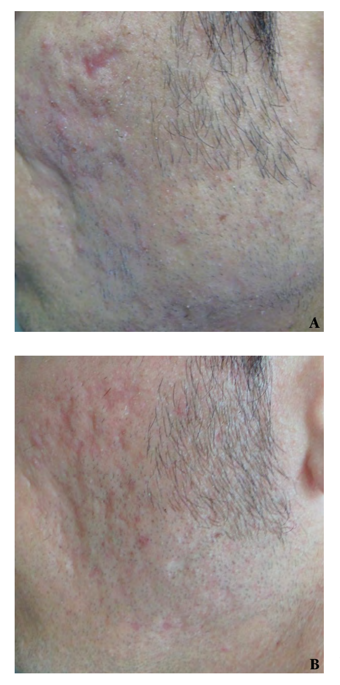
Figure 3. Left side of a patient's face before treatment with skin needling alone (A). Left side of the patient's face after treatment with skin needling alone (B).

as on skin that has been previously treated with lasers or dermabrasion.