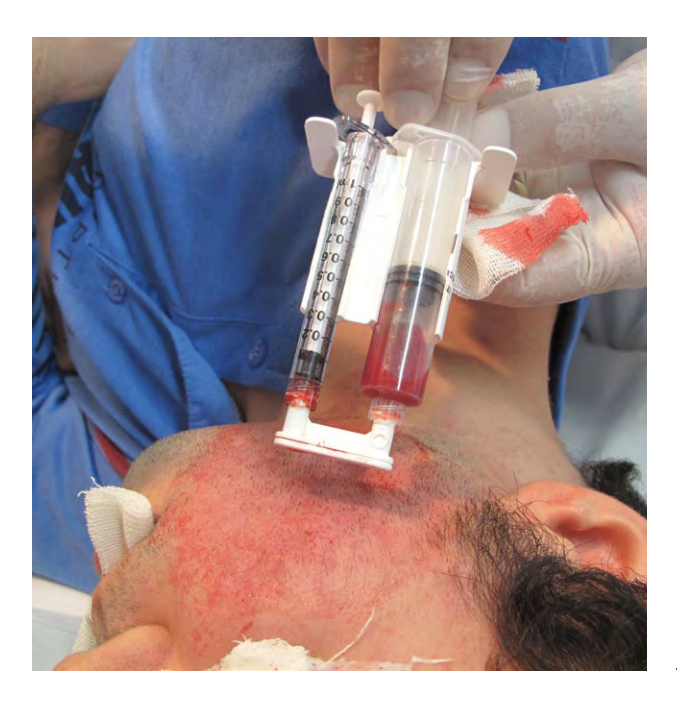
Figure 1. Platelet-rich plasma application.