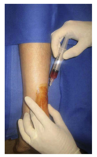
Fig. 3. PRP injection for chronic Achilles tendinopathy.

Muscle healing, like tendon healing, occurs in a series of overlapping phases, including inflammation, proliferation, and remodeling. These events are also