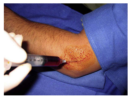
Fig. 2. Injection of PRP for chronic elbow tendinosis.

Anitua and colleagues<sup>45</sup> found faster recovery in athletes undergoing PRPenhanced Achilles tendon repair. In their study, athletes treated with surgery and PRP were compared with a retrospective control group of athletes treated with surgery alone. The PRP patients recovered range of motion earlier, had no wound complications, and returned to training activities in less time than control patients. The cross-sectional area of the PRP-treated tendons was also smaller than that in nontreated tendons when measured by ultrasound. Randelli and colleagues<sup>49</sup> recently